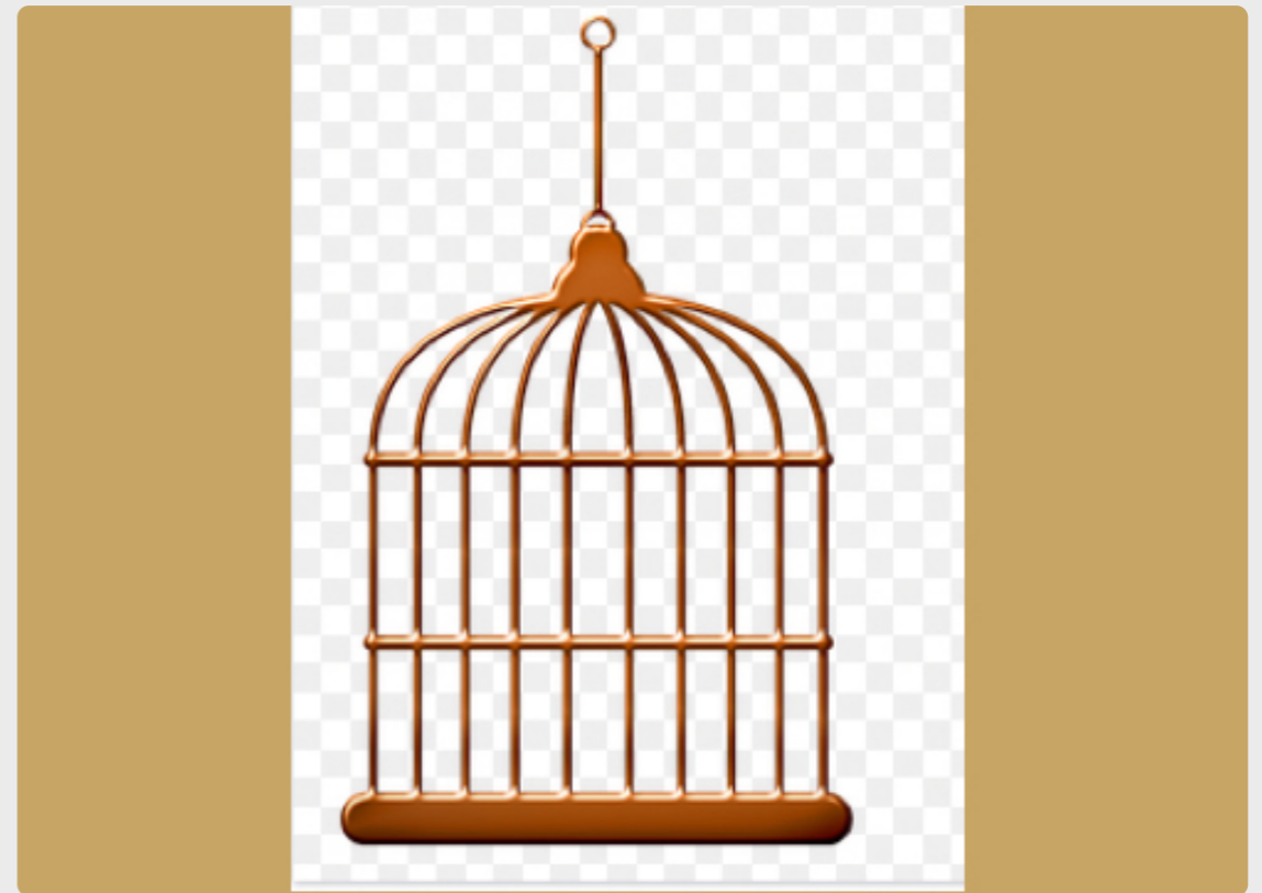
GALLERY 1.3 Golden cage

Sure enough, one day someone ran off with the hen in the golden cage. The king was glad he had had his magician switch the hens. He sent word for the magician to bring back his hen.