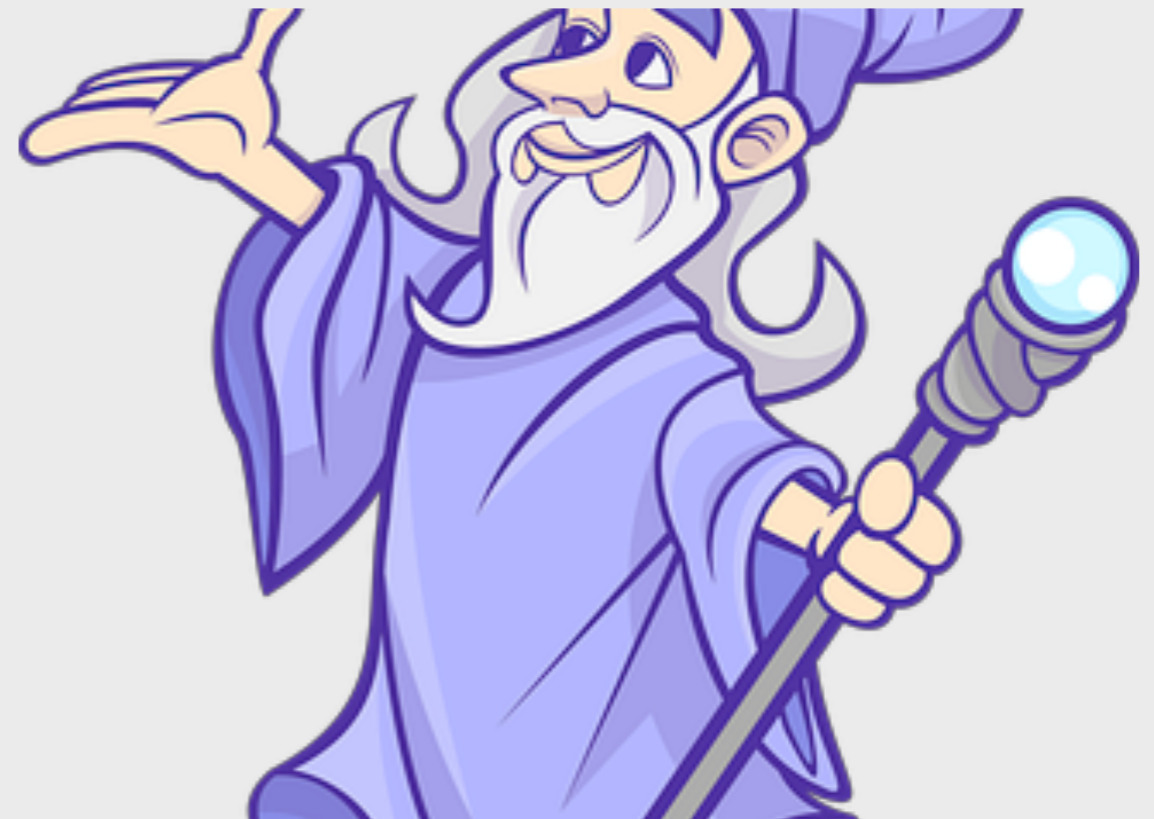
GALLERY 1.5 Magician

“Where is my magic hen?”, asked the King. I told you to bring her back. “I did bring her back,” said the magician. “I put her in the cage”, I just didn’t have time to change her back into a hen.”