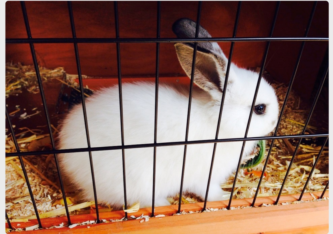
GALLERY 1.4 Rabbit