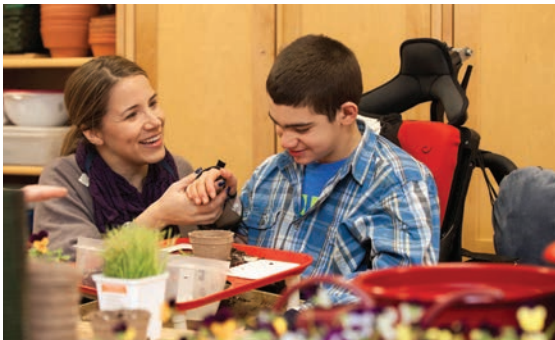
A Secondary Program student plants cat grass seeds at the Horticulture Center with help from his occupational therapist.