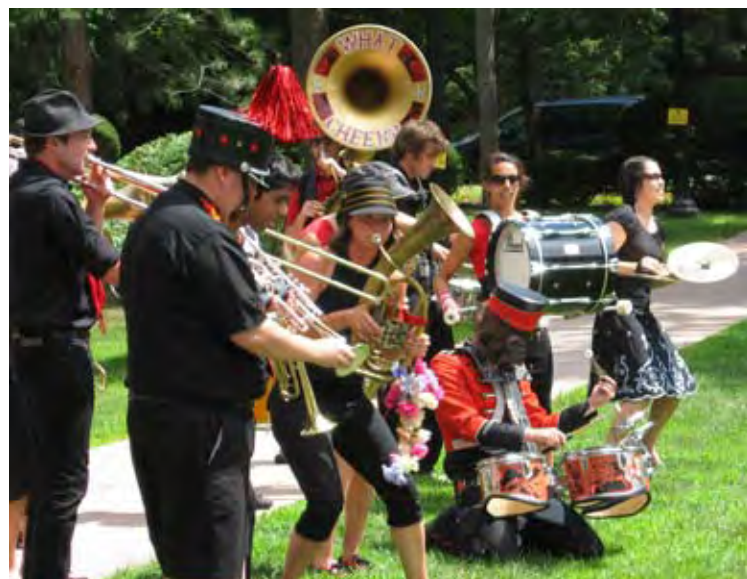
What Cheer? Brigade catches the beat