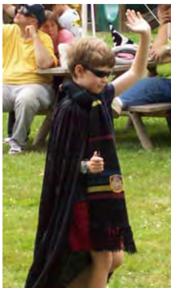
A wizard celebrates!

We played Harry Potter trivia and made magical crafts. The Deathly Hallows was available for purchase at the party in braille from National Braille Press, and in print, audio, and large print from Newtonville Books. Wilson Farms donated two delicious cakes - one looked like the cover of the Deathly Hallows , and one featured a "snitch," (Harry's Quidditch ball). Patrons of all ages enjoyed interacting with one another at the successful celebration.